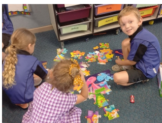
We are Problem Solvers