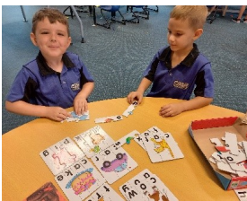
We are 21 st Century Learners

During the first weeks of school, we have been developing the skills, dispositions, and social interactions to enhance our learning.