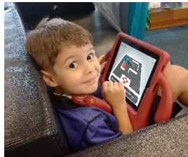
We are Researchers