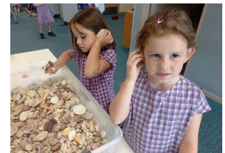
We are Thinkers