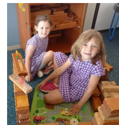
We are Collaborators