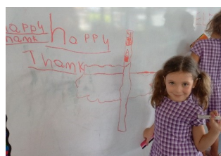
We are Communicators